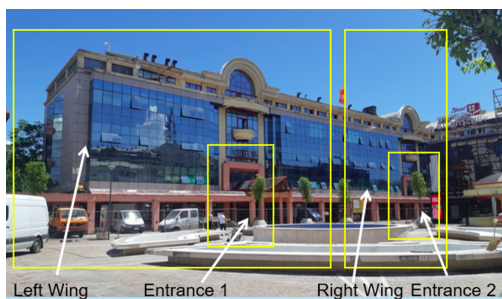
Ministerial complex in Podgorica, Montenegro

Fraunhofer IBP's experts have a long experience with energy-efficient, sustainable construction and housing. They design, support and evaluate energy concepts for high-performance buildings or districts and develop concepts for energy supply and climate protection, including long-term roadmaps for cities and municipalities.