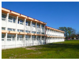
Before/after energy efficient retrofit: A school refurbished under a KfW-financed programme